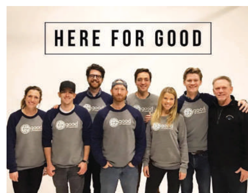
GMW Team '17

Be sure to look for new businesses that are supporting Friends through Good Meets World in future newsletters! www.goodmeetsworld.com